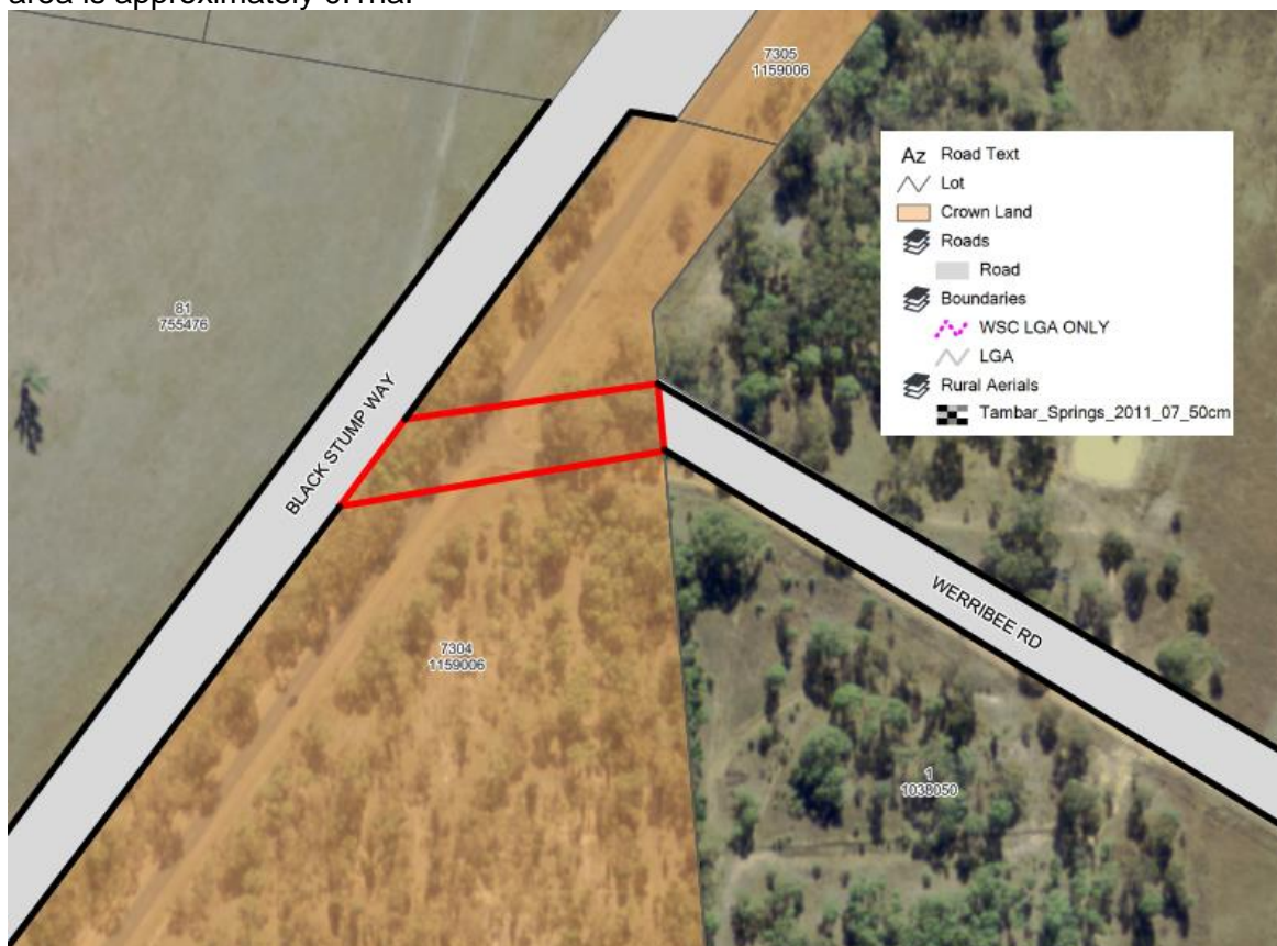
Figure 1. Land to be compulsorily acquired.

The proposed section of land to be acquired is indicated in red in the below map, the area is approximately 0.1ha.